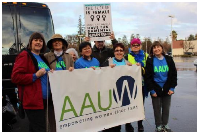
A few of the members of AAUW Stockton Branch who attended the Women's March on Sacramento on January 21 st