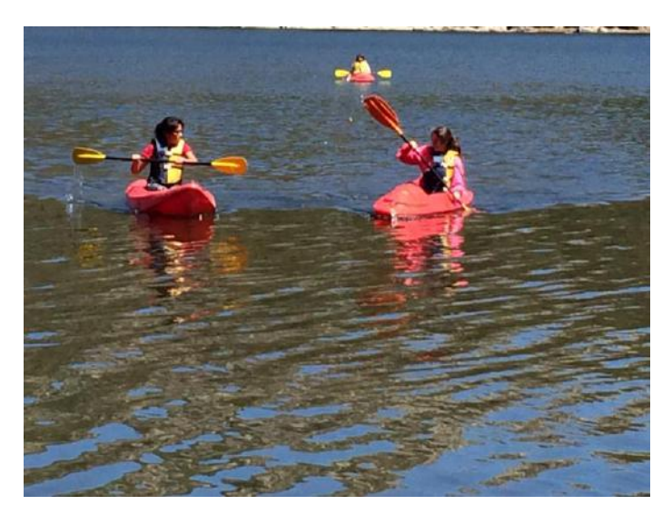
STEM girls at Silver Lake Camp.

The mentors met on August 22<sup>nd</sup> to plan the coming year's activities. Exciting things are in our future! Our first activity will be a gathering to welcome the new Tech Trek campers on September 18<sup>th</sup> and begin our five year relationship with them. Being a mentor is extremely rewarding and we all feel fortunate to be given this opportunity.