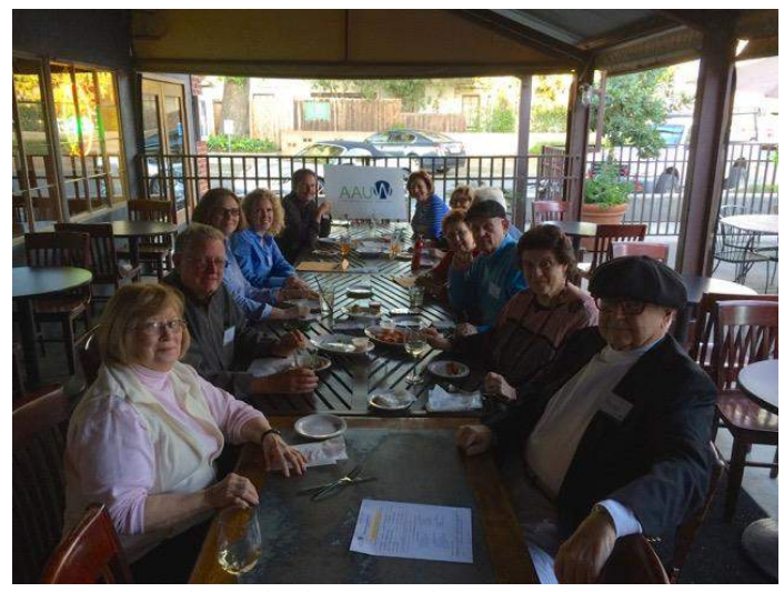
AAUW members had fun welcoming the new men of AAUW at Valley Brewing Company.