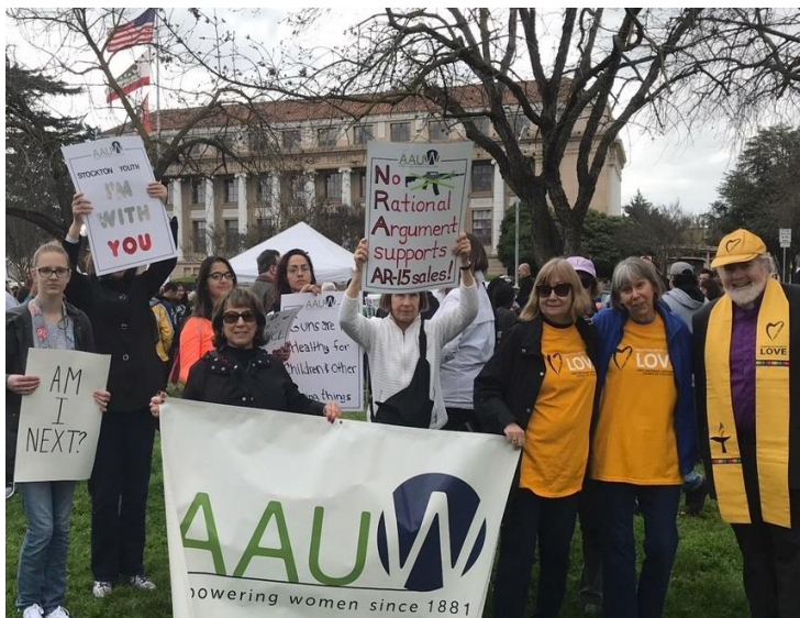
Stockton's March for Our Lives