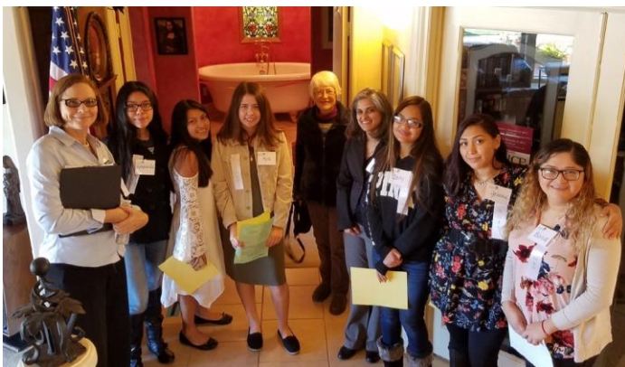
The morning shift at the Adams home.

Let's try to fill the room with our members to demonstrate our support.