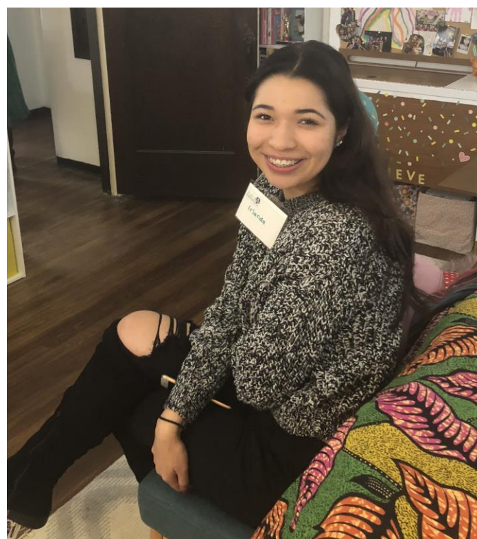
STEM Girls at the Home Tour