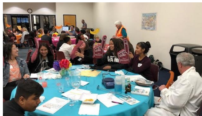
Dinner with a Scientist