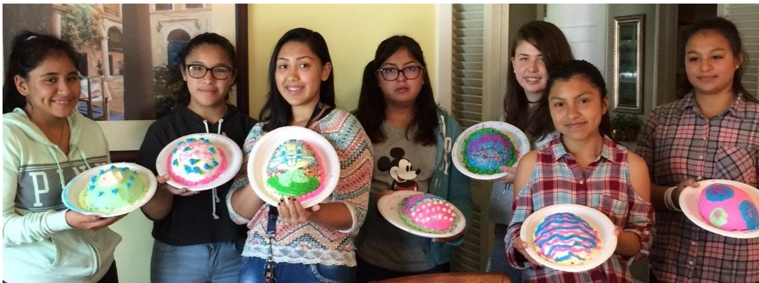
STEM girls hard at work creating Easter cakes and their finished projects.