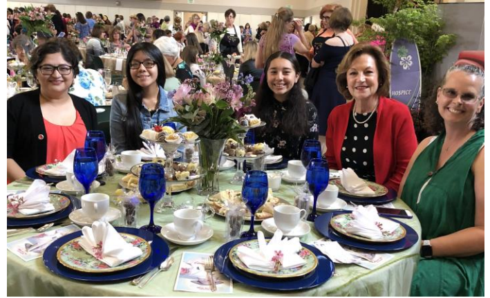
Hospice Butterfly Champagne (but not for us!) and English Tea!