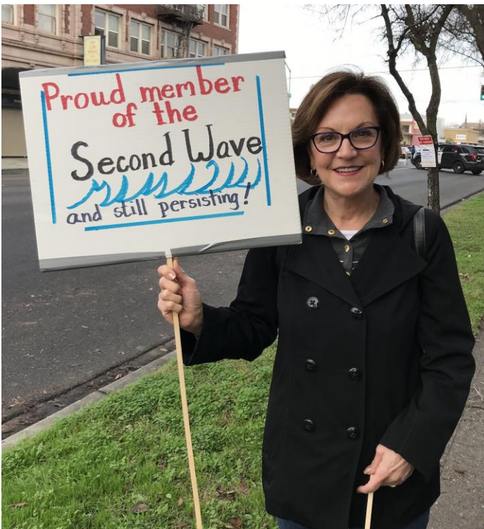
Stockton Women's March